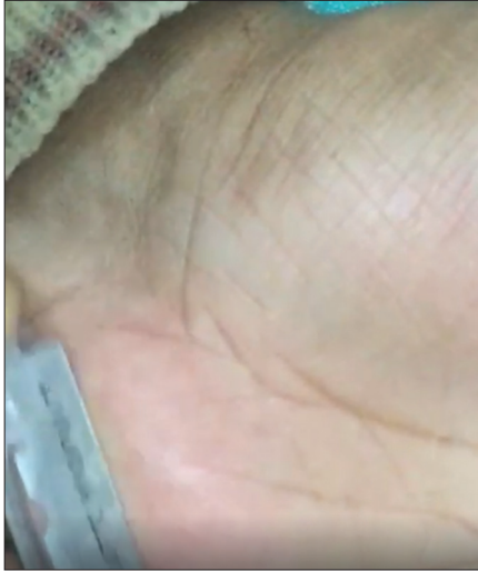
Video 1: The blade is handled with fingers during shaving surgery.

and has better alignment with the skin surface [Video 1]. This customized device can be used for shaving benign skin lesions and harvesting skin grafts.