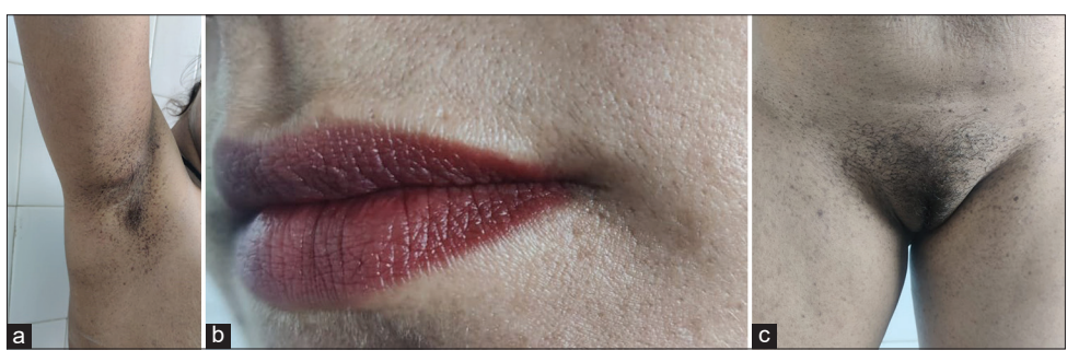
Figure 1: (a) Reticulate pigmentation of axilla, (b) Perioral pits, (c) Reticulate pigmentation of groin and Keratotic papules.

There is no definitive treatment available for reticulate pigmentation disorders till date. Topical steroids, hydroquinone, retinoic acids, azelaic acid, and systemic retinoids have been used without